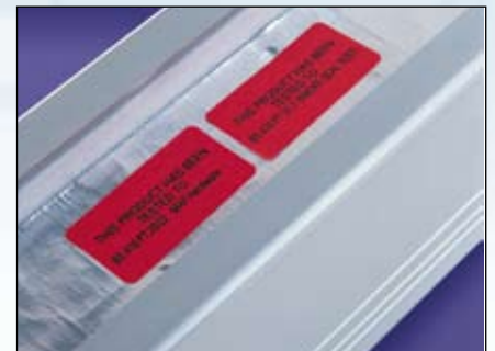
Close-up showing the intumescent liner on the fire-rated letterplate assembly.